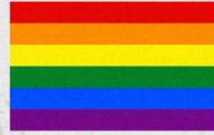
GAY, LESBIAN & PRIDE IN GENERAL