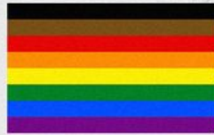
LGBT PEOPLE OF COLOR