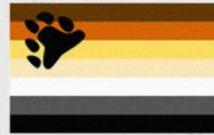
BEAR BROTHERHOOD SUBCULTURE